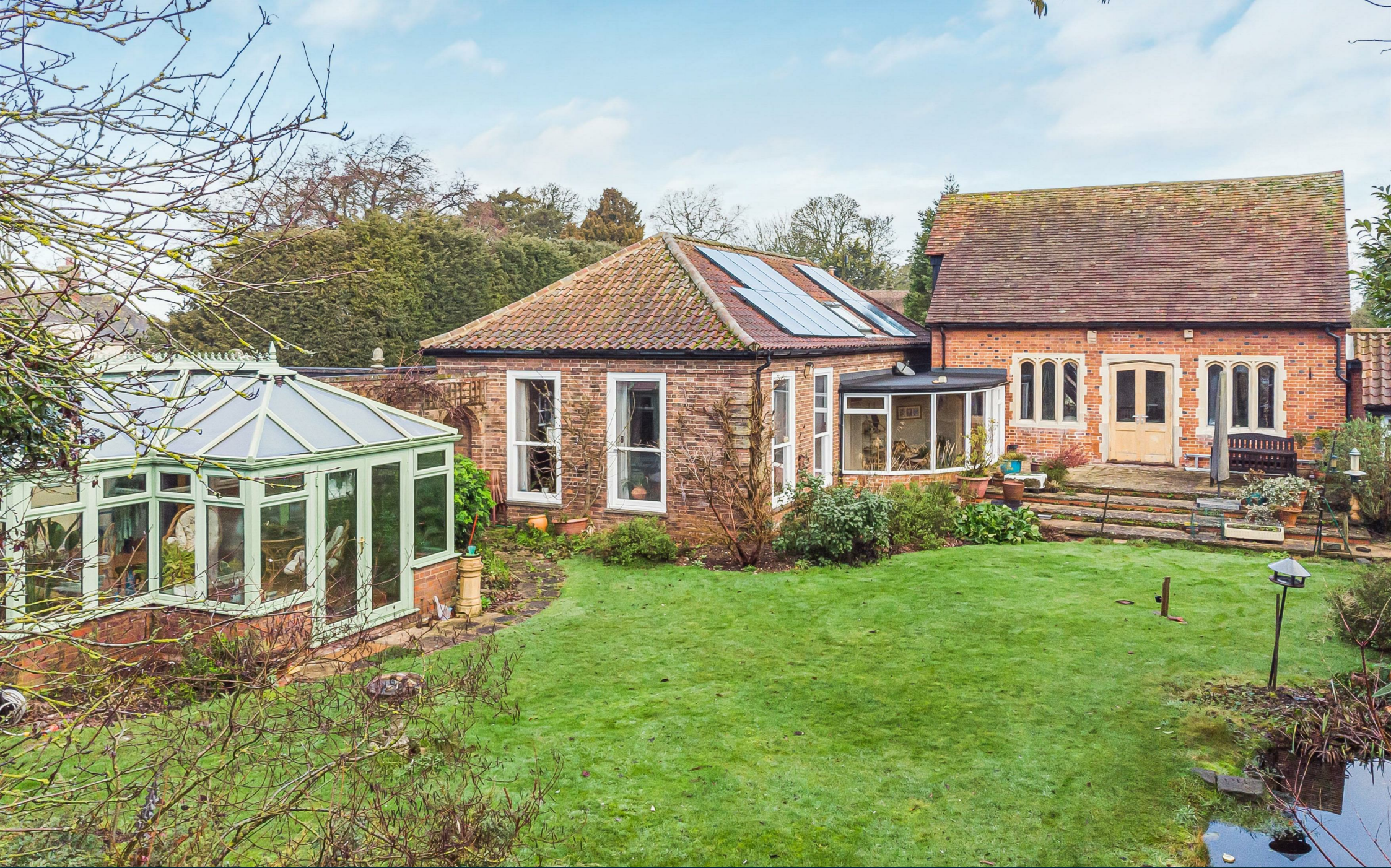
The Old School, Church Lane, Balsham, CB21 4DS